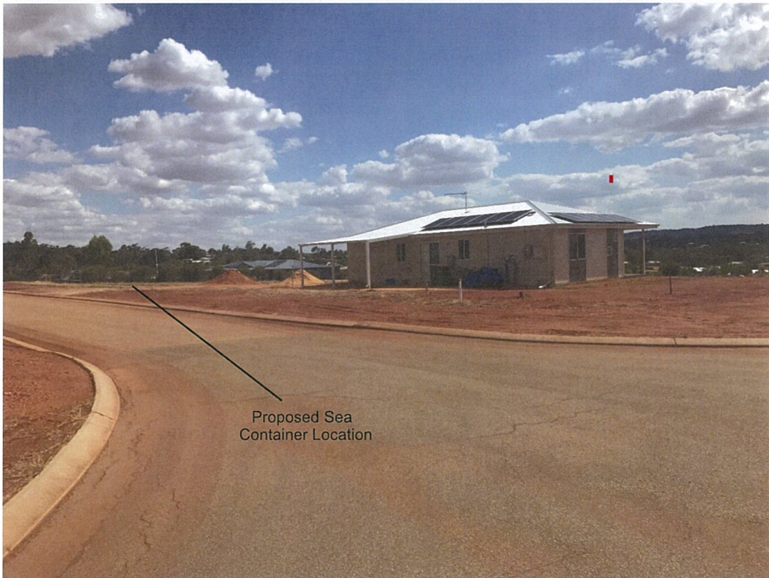
Photo of site from Camfield Place and Andrews Avenue intersection