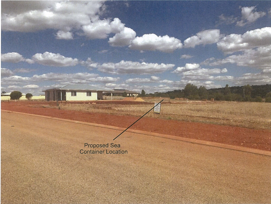
Photo of site from Andrews Avenue